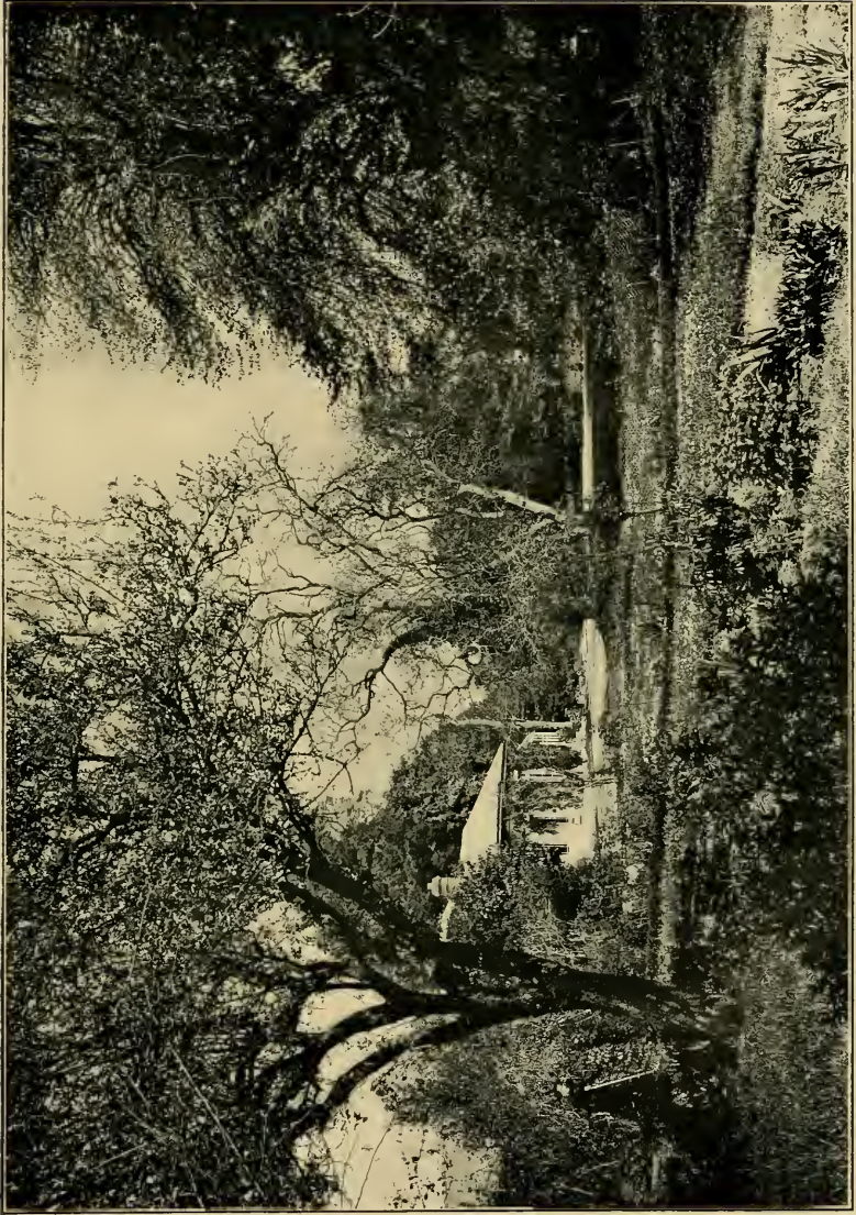
VILLA NOVA, GARDEN VIEW.